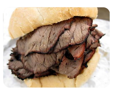
Call today for flexible options and pricing!