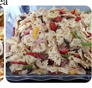
*Menu Prices Subject to Change*